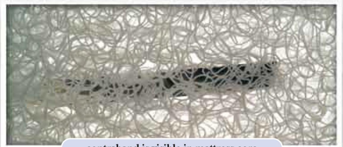
contraband is visible in mattress core