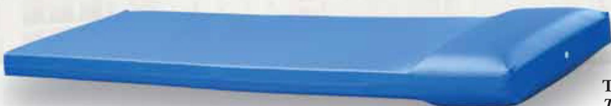
The Derby “Blue” The original sealed seam mattress