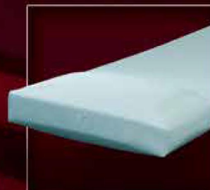
Available with Patented Integrated Pillow System

Abrasion resistant Envelope style construction Turned edge construction - all seams are inside the mattress Wipes clean (helps to reduce cross infection)