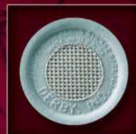
Patented Secure Care Flow Vent Helps Keep Contaminants from Mattress Interior